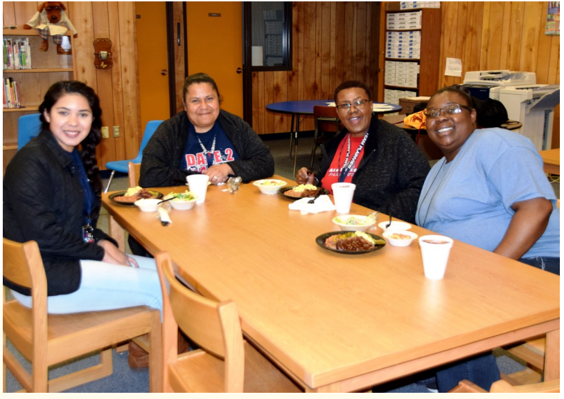
District administrators and the Board of Trustees are once again bringing brisket lunches to our well-deserving staff. Thanks to Aramark for preparing the delicious brisket and all the trimmings.