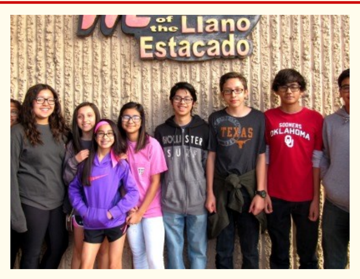
Over 90 students in the Estacado GEAR UP program had the opportunity to tour Wayland and South Plains College and learn more about the schools and opportunities that await in higher education.