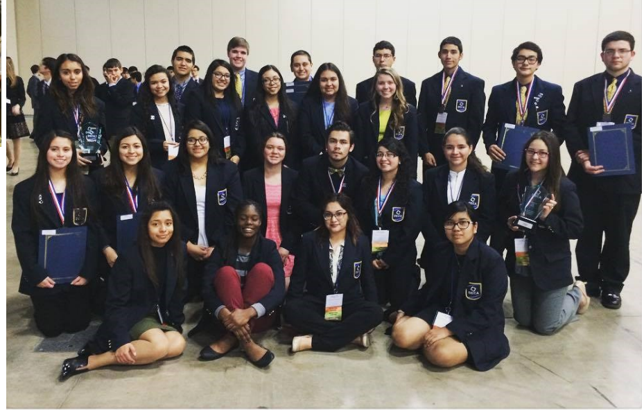
Seventeen Plainview High School DECA members will advance to the DECA 2016 International Career Development Conference (ICDC) in Nashville, TN, in April.